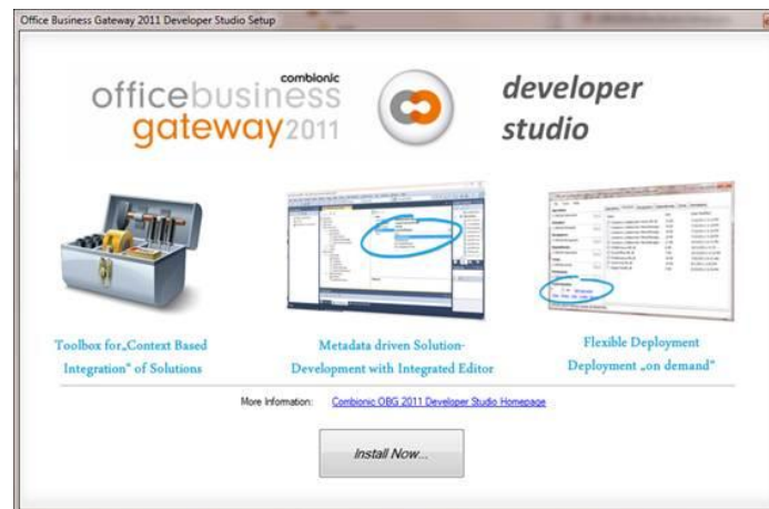
Figure 1: Start screen OBG Developer Studio 2011

The "Install Now..." button will start the installation procedure.